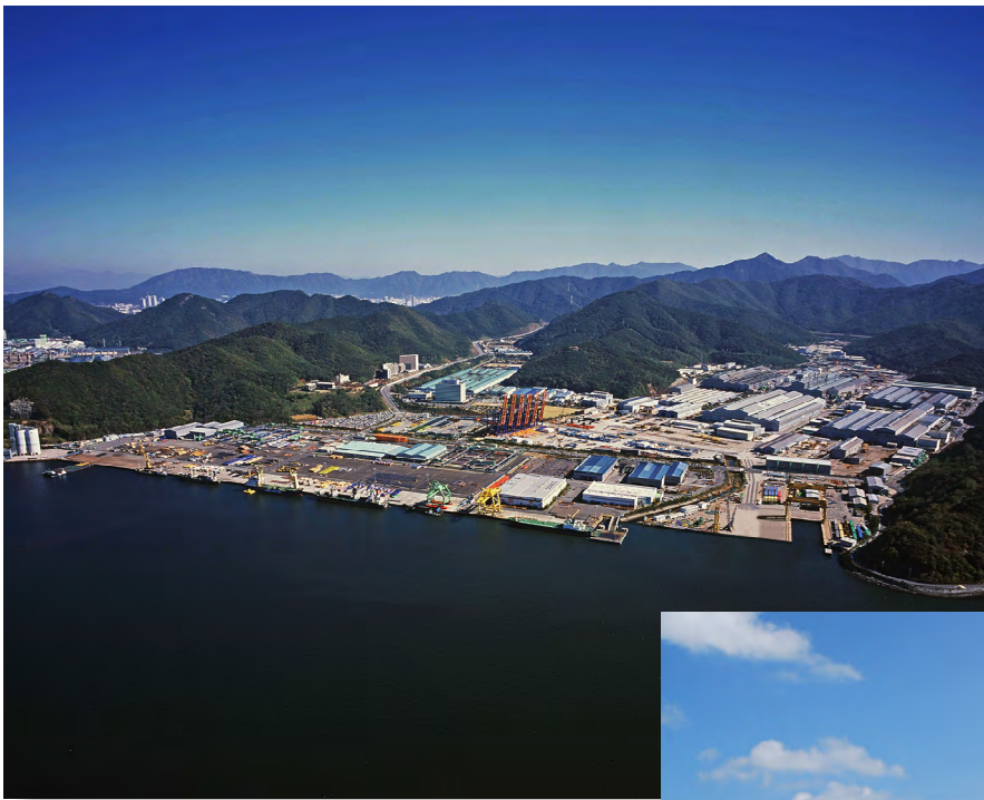
Top left: Changwon, Korea Bottom right: Vina, Vietnam

Doosan Lentjes benefits from the Group's international sourcing and manufacturing capabilities. High quality workshops under the full control of Doosan in Changwon/Korea and Vina/Vietnam provide best practice procurement of goods and services while maintaining and ensuring compliance with laws, regulatory guidelines, and internal control procedures. Procurement hubs in Beijing and Shanghai/China underline Doosan Lentjes' efforts for cost optimised solutions.